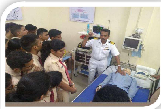
ACADEMICS – SKILL LAB

(e) The final result of the selected Merit List and Wait-list candidates would be available on the DGAFMS official website: www.afmcdg1d.gov.in and www.afmc.nic.in