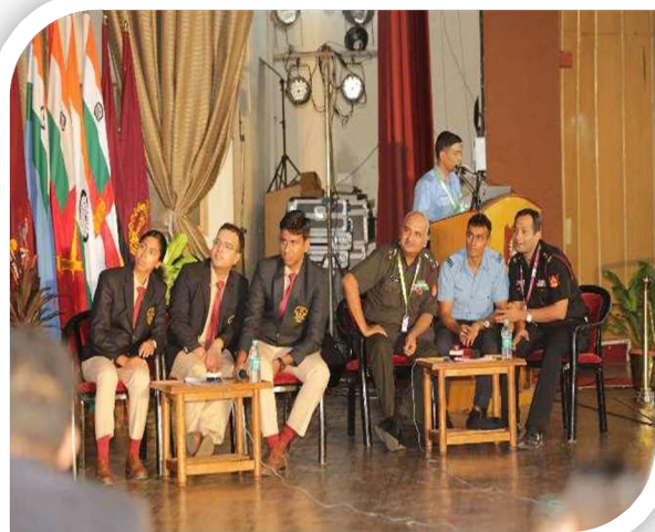
DEBATE & QUIZ CLUB