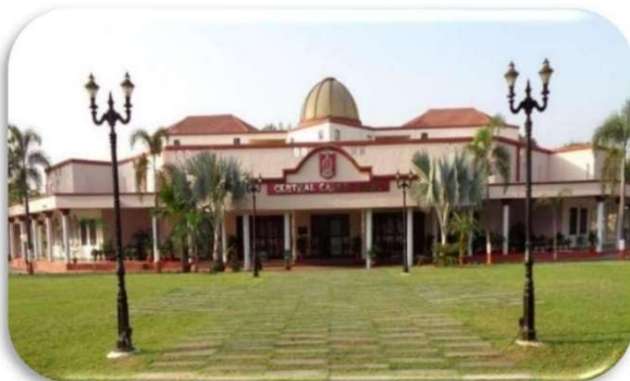
CENTRAL CADETS MESS