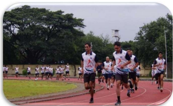
WORLD CLASS ATHLETIC TRACK