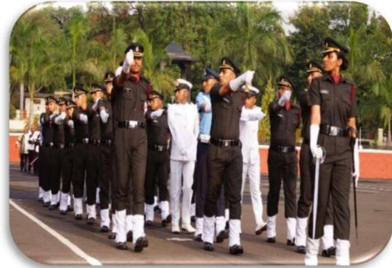
PASSING OUT PARADE

42. Promotions to next higher ranks exist in the Cadre subject to satisfactory service and fitness for the rank. The rank structure and the promotions applicable to AFMS officers are as tabled under: -