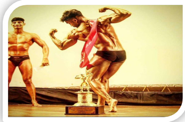
'MR AFMC' COMPETITION