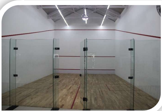
INDOOR SQUASH COURT

48. There is no provision of any medical board being held in civil / private hospital. Fitness of the candidates is decided as per the medical fitness standards and criteria prescribed for grant of Commission in the Army Medical Corps and decision of Commandant, AFMC will be final in this regard.